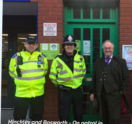
Hinckley and Bosworth - On patrol in Hinckley Town Centre with the Beat Officers