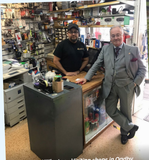
Oadby and Wigston - Visiting shops in Oadby