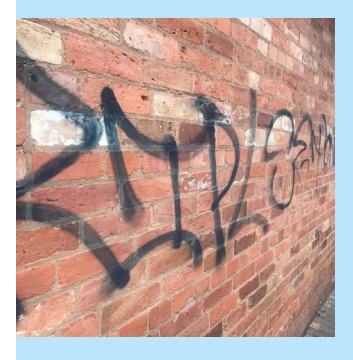
Combatting Burglary and Anti-Social Behaviour See page 2