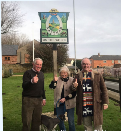
Melton – visiting Waltham on the Wolds